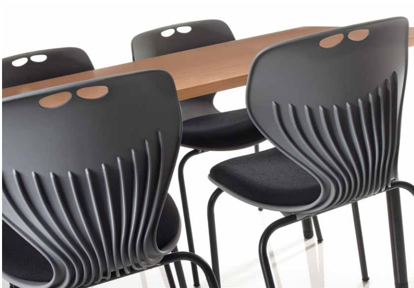
▲ Mata is the perfect compact meeting room chair