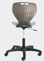
▲ Swivel Gas Lift Chair H795-925 W615 D420 SH455-585mm MATA SM6S