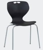
▲ 4 Leg Chair H815 W510 D420 SH470mm MATA SM6L