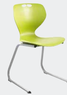
▲ Reverse Cantilever Chair H810 W510 D520 SH480mm MATA SM6C