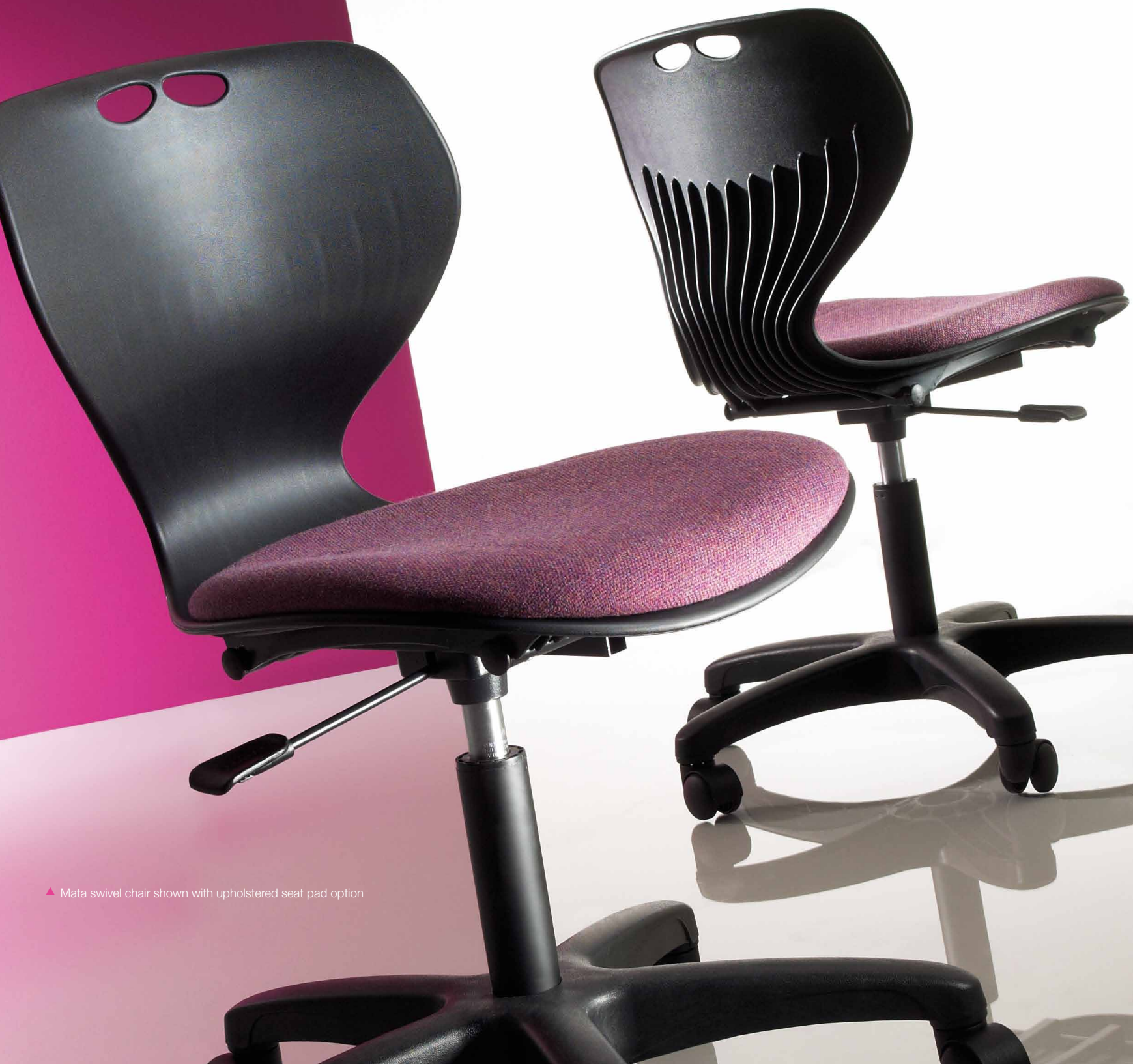
▲ Mata swivel chair shown with upholstered seat pad option

“Equally at home in the classroom or meeting room”