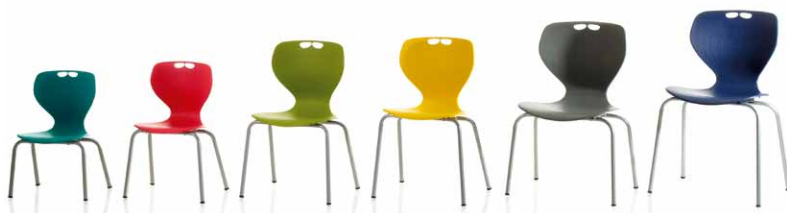
▲ Mata 4 leg is available in six EN 1729 sizes, please see following pages ▶▶▶