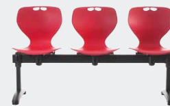
▲ Beam For information on Mata beam seating please refer to page 85.